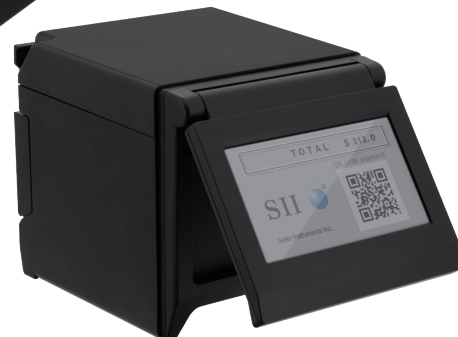
RP-F10 + LCD(Optional)